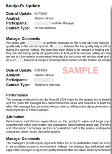
Sample Analyst Update

Wealth Management Heritage – For over a decade, Prima’s technology and advice have been put to work for advisory businesses, large and small, to ultimately benefit high net worth investors.